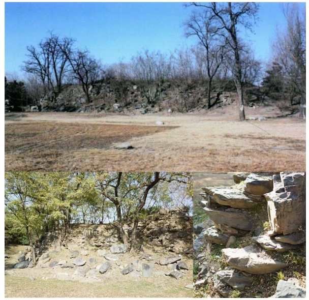
Figure 9 Current situation of the Longevity Hill(top from Guo Daiheng, Drawing and Documents of Yang-shi-fang: Memory Heritage of Yuanmingyuan, button by the author)

was clearly showing. Although the rocks on the both sides of the winding path have fallen off seriously, but its boundary was distinct. There was a remained rock steps about 3.5m*2.5m on the north side of the pass. This situation is not consistent with the pattern of the Longevity Hill in the late reign of Xianfeng, which is shown in sample 1203, a full picture which is collected by the Musée Guimet in France, book 3892, and 5462. But it seems to be more close to the pattern in sample 001-2 and sample 001-3. The reason of that needs further discussion and research. The damage of the existing rockery was relatively serious, for the crevices of some rocks could be observed clearly and the phenomenon of weathering of some rocks (lower right of Figure 9) was even found. Compared with the image materials of the last ten years, miscellaneous trees (mainly pseudoacacia) grew rapidly, which brought some adverse effects on the Longevity Hill although the greening effect of it was good.