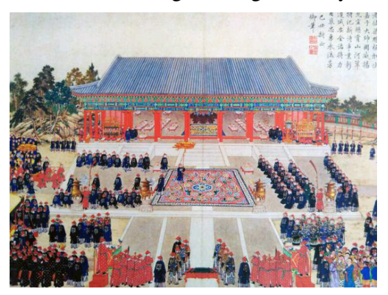
Figure 6 Figure from painting album of the government suppressing the Zhang'ge'er Rebellion in Daoguang's reign(from Guo Daiheng. Gone Brilliant: Research and Protection of Old Summer Palace Landscape and Architecture)

Figure 5 Drawing from Yang-Shi-Fang in late reign of Daoguang to early reign of Xianfeng(from Guo Daiheng, Drawing and Documents of Yang-shi-fang: Memory Heritage of Yuanmingyuan)