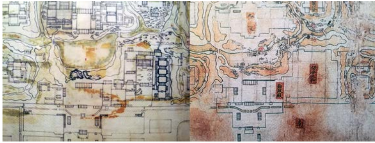
Figure 2 Drawing from Yang-Shi-Fang in mid-late reign of Qianlong(from Guo Daiheng, Drawing and Documents of Yang-shi-fang: Memory Heritage of Yuanmingyuan)

(5) It was the same as the Forty Scenes of Yuanmingyuan that the branch of the Donghu Hill was located near the eunuch room which is beside the west of the west side-hall.