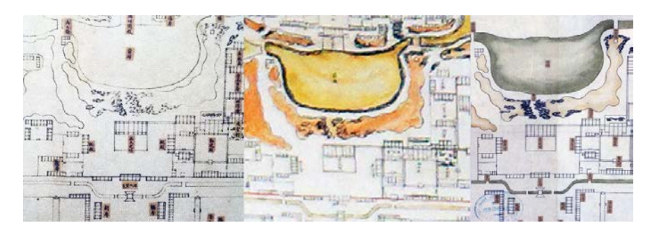
Figure 7 Drawing from Yang-Shi-Fang in late reign of Xianfeng(from Guo Daiheng, Drawing and Documents of Yang-shi-fang: Memory Heritage of Yuanmingyuan)