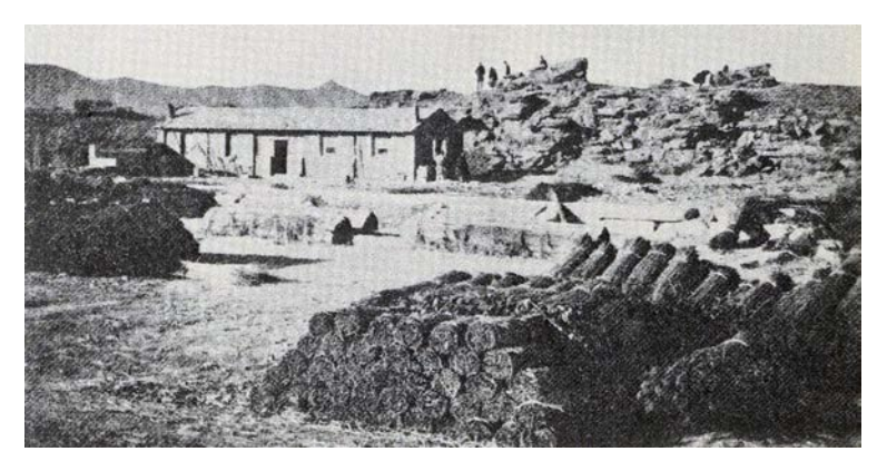
Figure 8 A photograph of the Longevity Hill (from Malone B.C. History of The Peking Summer Palaces under The Ching Dynasty)